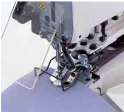
● Attaching flat buttons (small)

* For all stitch shapes, three different pieces of data can be established by selecting the number of stitches and stitch pitch within the respective data setting ranges.