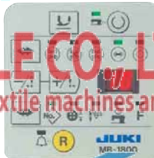
● Easy-to-use operation panel

Shorter lengths of thread remain after thread trimming