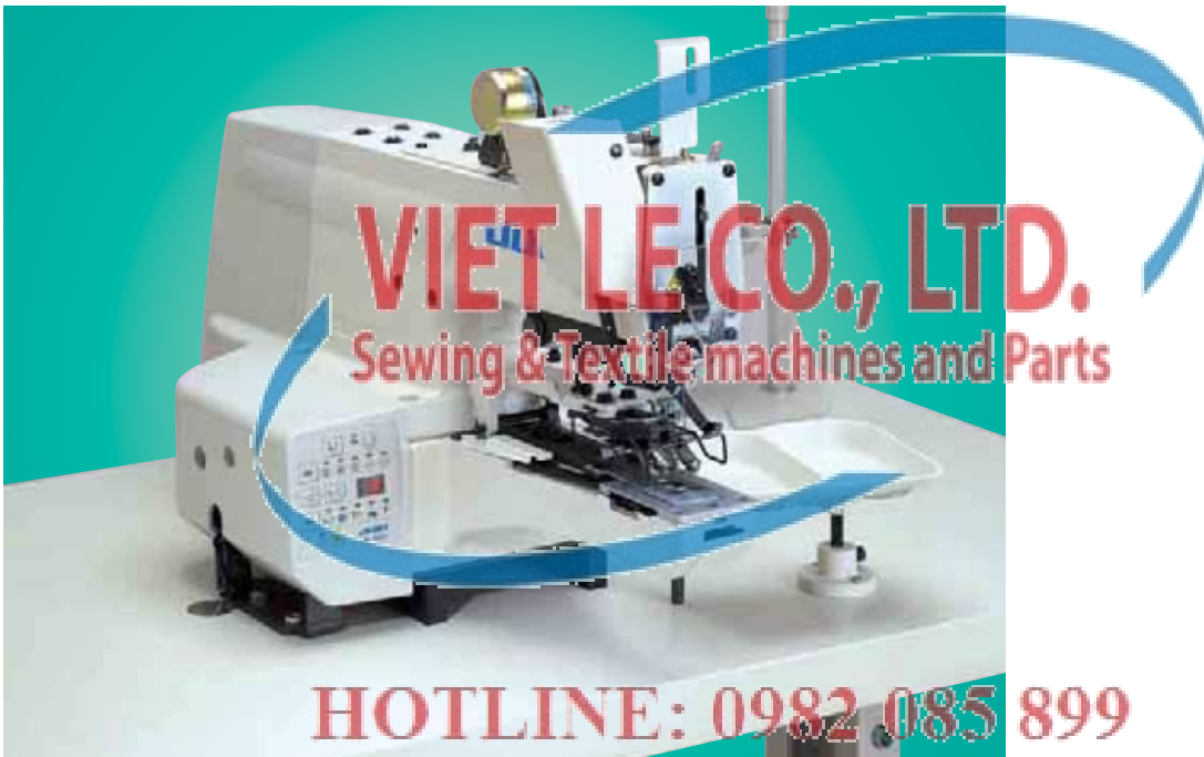
MB-1800B (Table stand is optionally available.)

A new button sewing machine that supports many different button sewing specifications independently.