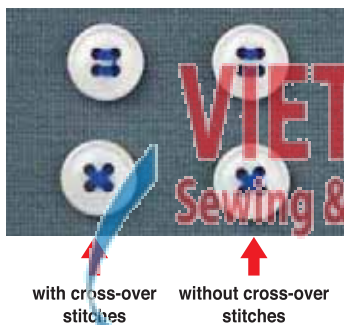
with cross-over stitches