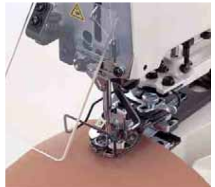
● Button neck wrapping, 1st process (Attachments are optionally available)