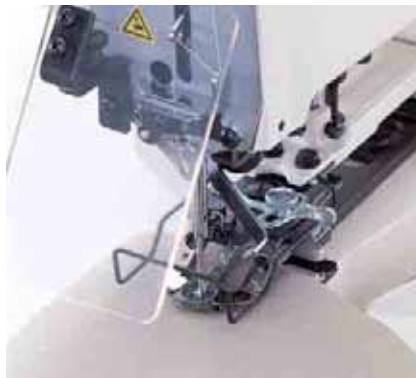
● Space pin (accessory)