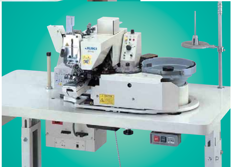
MB-1800A/BR10 (The stand leg is optionally available.)