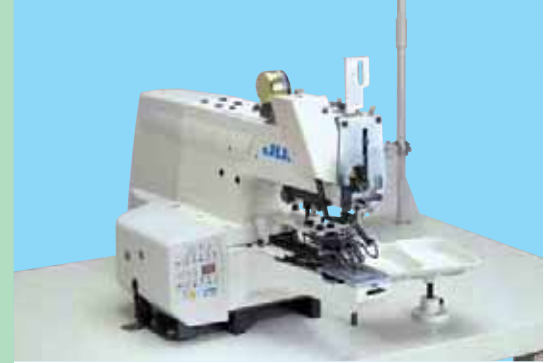
MB-1800B (Table stand is optionally available.)

It comes with direct-drive electronic feed driven by a compact AC servomotor to guarantee excellent seam quality and dramatically improve flexibility and maintainability.