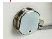
Needle thread clamping device

*LU-2828ESA-7 can produce the effect of shorter-thread remaining by making condensed stitch